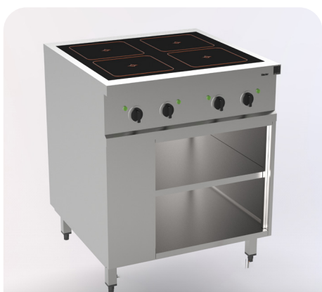
MH 200121 - Vitro-ceramic hob with pot recognition