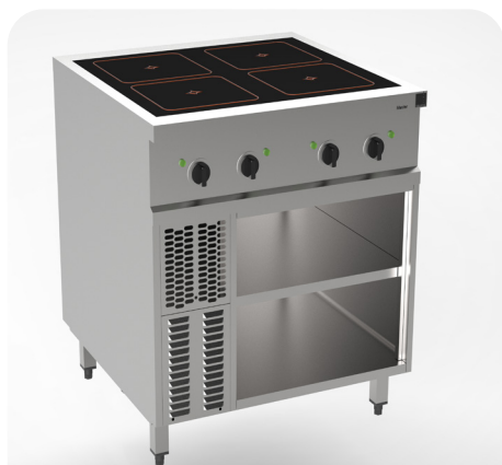
MH 200201 - Induction hob 4x round coils

Examples of the highest ergonomic and hygienic standards are the flush-mounted hobs and the large, easy-to-clean radii in the substructure . Additional frames for hygienic wall closure are available as an option.