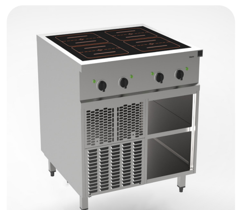
MH 200221 - Induction hob 4x double square coils