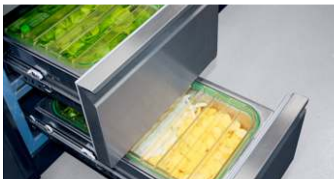
The smart cooking principle