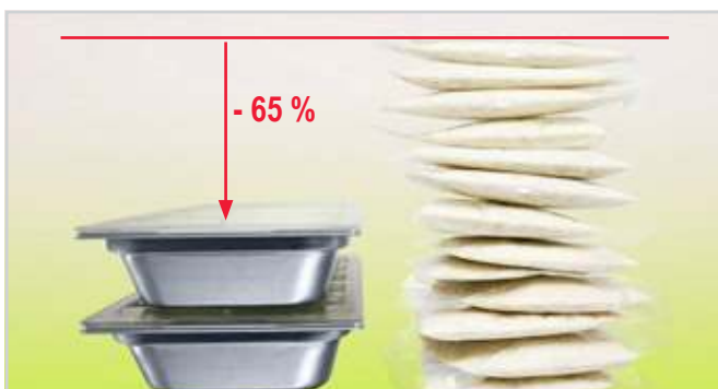
65 % less packaging