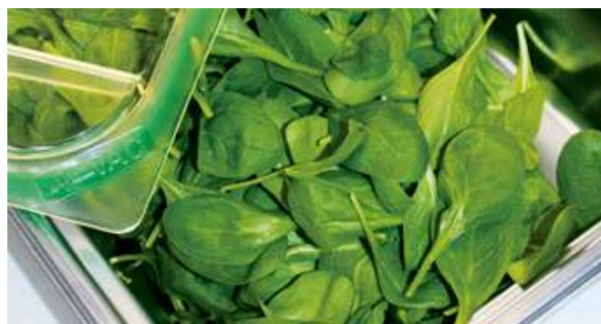
Vacuum packaging with no limits